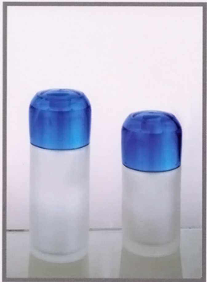
○HK20C-27 Specification: \Phi 20/410 Discharge Rate: 0.20ml/T