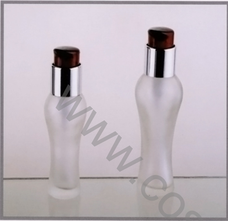
○HK22E-3 Discharge Rate: 0.5ml/T