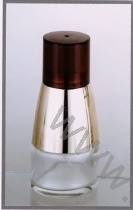
◎HK18B-8 Specification: \Phi 18/410 Discharge Rate: 0.20ml/T