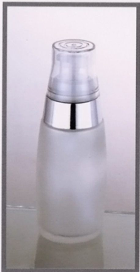
◎HK20C-28 Specification: \Phi 20/410 Discharge Rate: 0.20ml/T