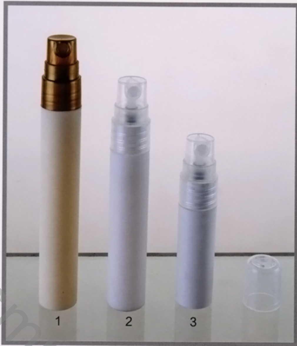
1 2 3