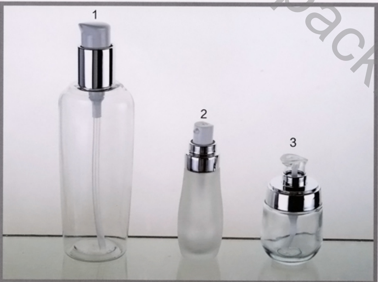
1: ○HK24E-3-1 Specification: \Phi 24/410 Discharge Rate: 0.5ml/T